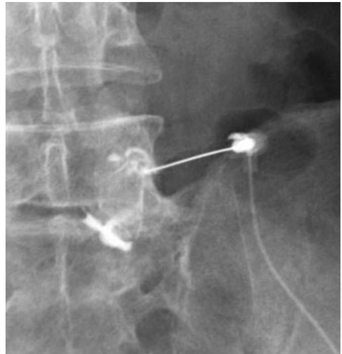
Figure 1. The patient had persistent right lower back and buttock pain. MRI showed L5-S1 facet arthropathy without substantial disk disease. The fluoroscopy image shows the needle placed in the right L5-S1 facet joint with contrast material outlining the joint capsule. The anesthetic agent decreased symptoms immediately, providing diagnostic information about the L5-S1 facet. Medial branch block was subsequently performed.

In the setting of acute or subacute symptoms, steroid administration can speed recovery and enable the return to normal daily activities, thereby limiting or preventing muscular weakening. In other cases, an injection can decrease symptoms sufficiently to allow the patient to begin physical therapy or initiate an exercise program that strengthens the musculature,