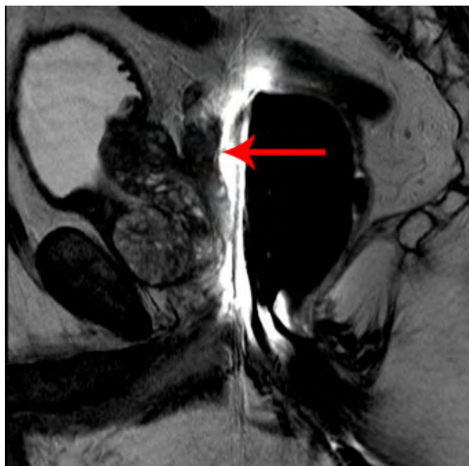
Figure 2. Sagittal T2 weighted MR image of the prostate with a prostate coil shows low signal mass involving the base of the seminal vesicles (arrow) consistent with invasion of the seminal vesicles.

Dynamic contrast-enhanced MR imaging is another promising method for the diagnosis of prostate cancer. Like other tumors, prostate cancers induce angiogenesis and the development of vascular abnormalities. This results in more rapid uptake of contrast agent into the tumor as well as more rapid wash-out. However, the analysis of dynamic contrast