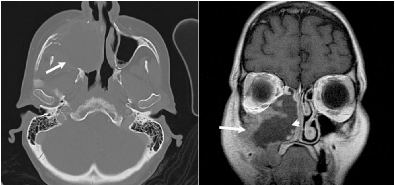
Figure 4. (A) CT of a patient with maxillary sinus cancer demonstrates bony destruction, (arrow) a hallmark of malignancy. (B) MRI in the same patient more accurately distinguishes between the intermediately enhancing tumor (long arrow) lining the maxillary sinus and the non-enhancing secretions (short arrow) filling the maxillary sinus.

of allergic fungal sinusitis, often appear hypointense by T2-weighted MR imaging. Similar ranges in intensity may be observed in mucoceles, which also have varying concentrations of protein.