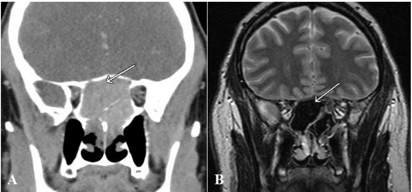
Figure 3. (A) CT in a patient with allergic fungal sinusitis leading to a sphenoid mucocoele. Note the markedly hyperdense secretions and the expanded bony margin (arrow). (B) T2 weighted MRI in the same patient demonstrates the limitations of MRI in the evaluation of benign sinus disease: the inspissated secretions filling the sphenoid sinus are so proteinaceous that they are very hypointense on T2 weighted imaging (arrow) and give the false impression that the sinus is aerated.

therefore, the gold standard for delineating inflammatory sinus disease and evaluating mucosal abnormalities, sinus ostial obstruction, anatomic variants, and sinonasal polyps. Multidetector CT (MDCT) allows objective assessment of the patency of intercommunicating passages and shows how anatomic variants, inflammatory disease, or both may affect patency. Anatomic variants that may predispose to disease include septal deviation, concha bullosa, Haller cells, hypoplasia of the maxillary sinus, and narrowing or obstruction of the osteomeatal complex. MDCT can show anatomic structures that are not visible by physical examination or nasal endoscopy and is, therefore, the study of choice for the surgeon who is considering or planning functional endoscopic sinus surgery.