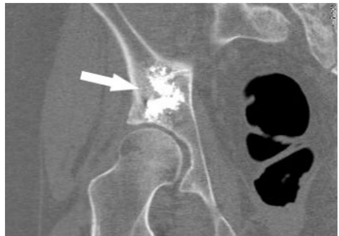
Figure 5. Post-procedure CT scan after augmentation of right acetabulum showing satisfactory placement of cement.